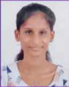
DRAKSHAVENI Maple Tax Consulting LLC