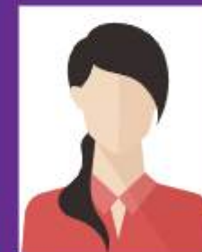
MANISHA Maple Tax Consulting LLC