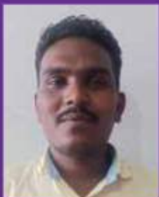
SUDHARSHAN Moolya Software Testing