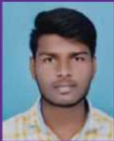
IMRAHN Itilite Technologies