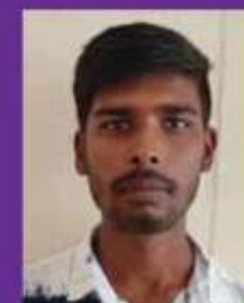
SIDDHARTHA SAAR Microsystems