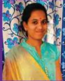
AMULYA Advent Global Solutions