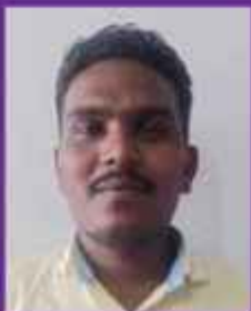
SUDHARSHAN Moolya Software Testing