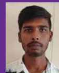
SIDDHARTHA SAAR Microsystems