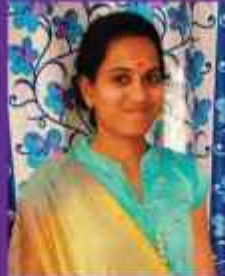
AMULYA Advent Global Solutions