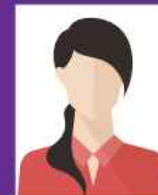
MANISHA Maple Tax Consulting LLC