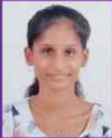
DRAKSHAVENI Maple Tax Consulting LLC