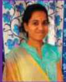
AMULYA Advent Global Solutions