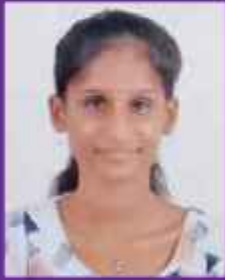
DRAKSHAVENI Maple Tax Consulting LLC